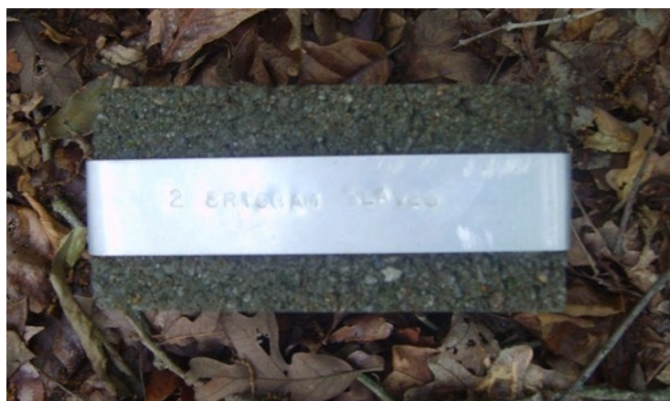
Fig. 9 – Small cinder block grave marker for “2 Brigham Slaves” in Brigham Cemetery, LBL; at: https://www.findagrave.com/memorial/19017112/slave-brigham .