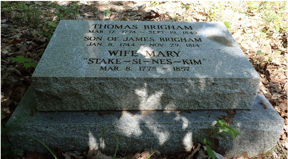
Fig. 1 -, at Brigham Cemetery, Land Between The Lakes (LBL) National Recreation Area, United States Forest Service on June 6, 2023.